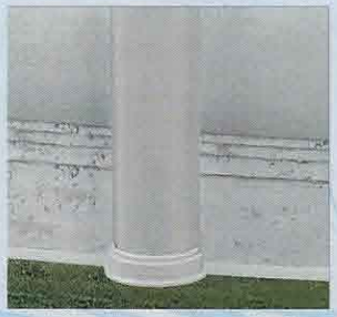
One-piece resin foot collar