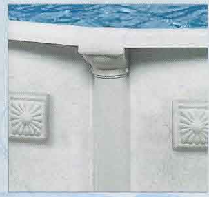
Ledge, cap and post designed for a secure fit