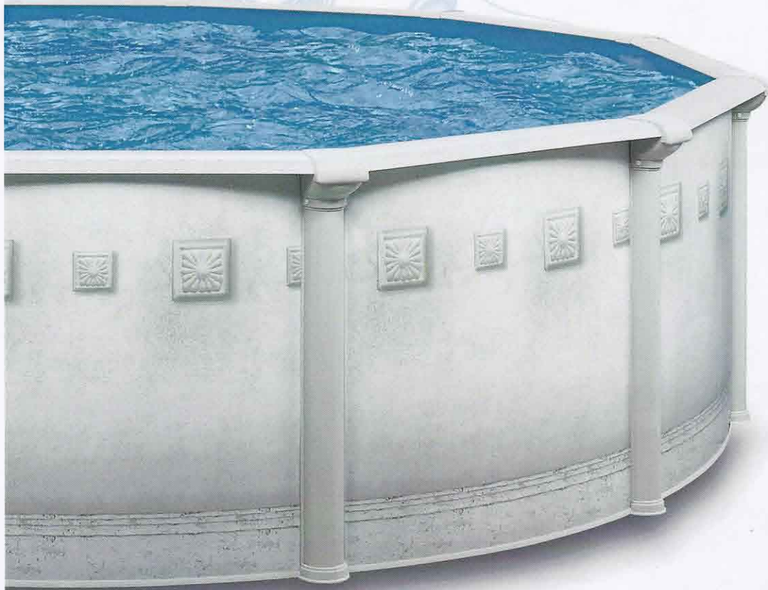
Round Kamika - Tuscan wall offered in 52 inches

Pool World Inc Rt 61 Shamokin, PA 17872 570-644-1314 1-800-895-1314 www.poolworldinc.com