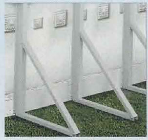
Heavy-duty angle brace system